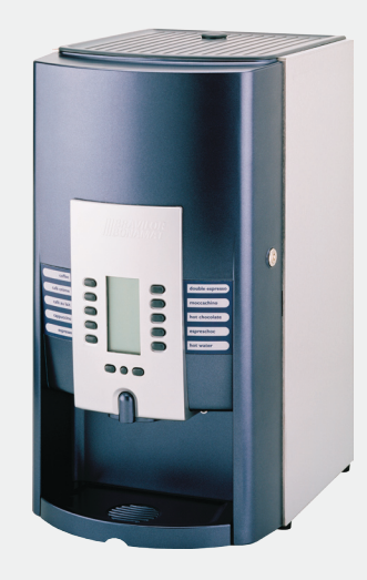
Bolero 211 Order Code: BVI0211